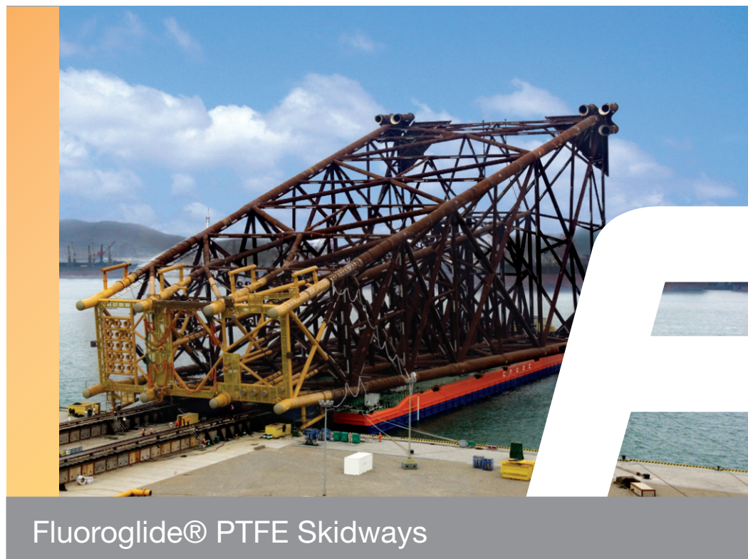
Fluoroglide® PTFE Skidways

At Fluorocarbon we have been successfully designing and manufacturing bonded PTFE/metallic Fluoroglide® skidway plates for over 25 years. Our skidway plates are used in many construction yards throughout the world to assist in skidding oil jackets, modules and heavy structures. Jackets and decks with weights up to 30,000 tonnes have been successfully loaded out on Fluoroglide® skidway plates.