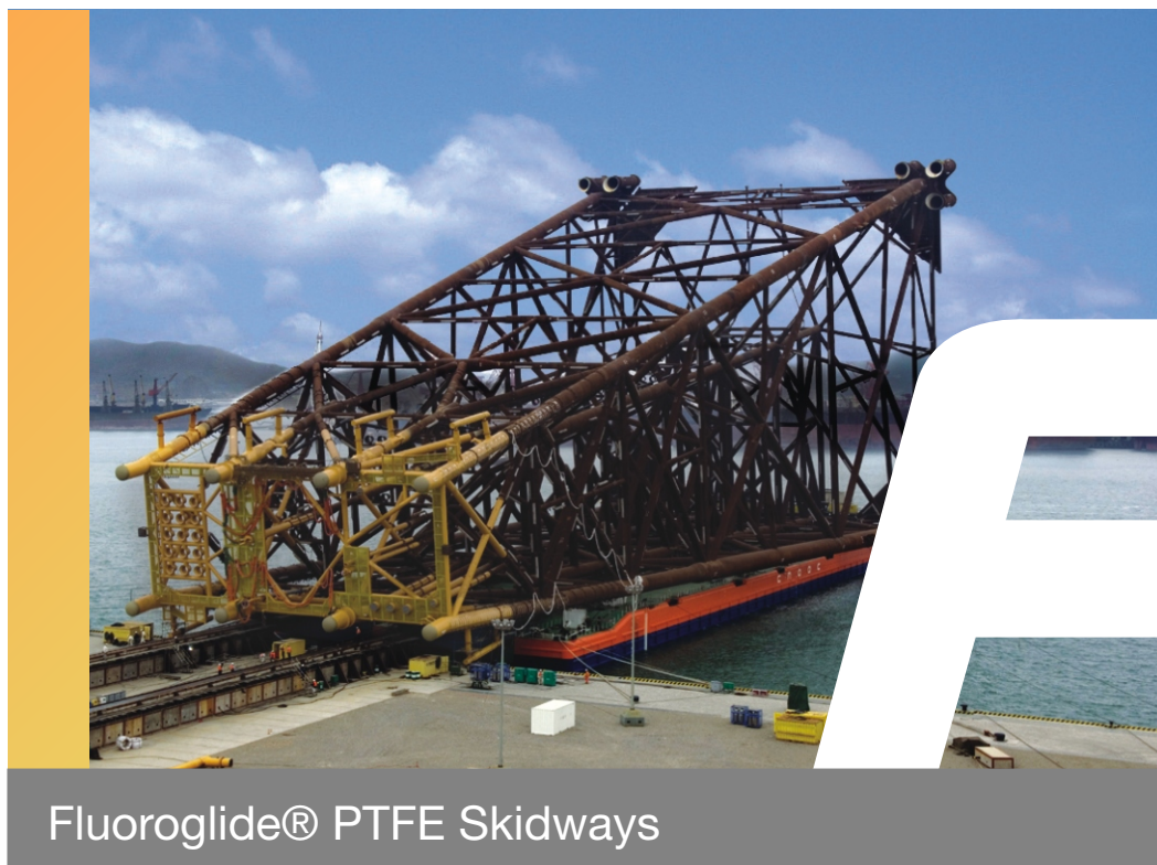
Fluoroglide® PTFE Skidways

At Fluorocarbon we have been successfully designing and manufacturing bonded PTFE/metallic Fluoroglide® skidway plates for over 25 years. Our skidway plates are used in many construction yards throughout the world to assist in skidding oil jackets, modules and heavy structures. Jackets and decks with weights up to 30,000 tonnes have been successfully loaded out on Fluoroglide® skidway plates.